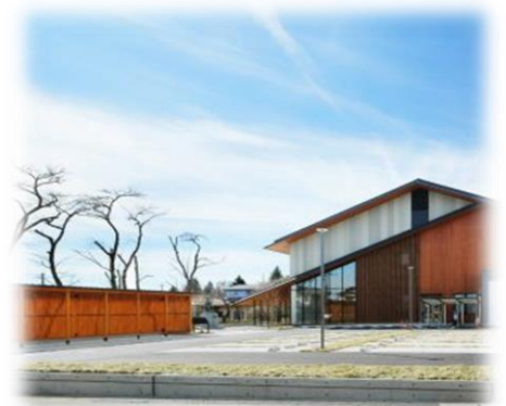
日光市市民活動センター NIKKO Civic Activities Support Center

（Address: 304-1 Imaichi, Nikko City TEL: 0288-22-2271）